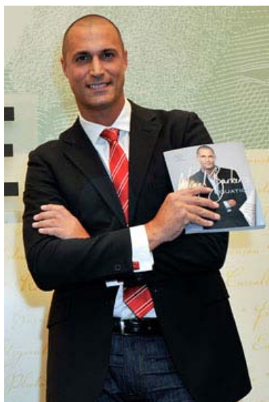
Nigel Barker promotes his new book, "Beauty Equation: Revealing a Better and More Beautiful You."

"America's Next Top Model" judge and photographer Nigel Barker , claims to have discovered the winning equation for beauty: